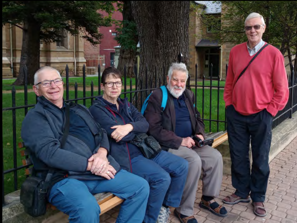
The New Zealand contingent, Hobart 12-Bell Weekend, March 2024