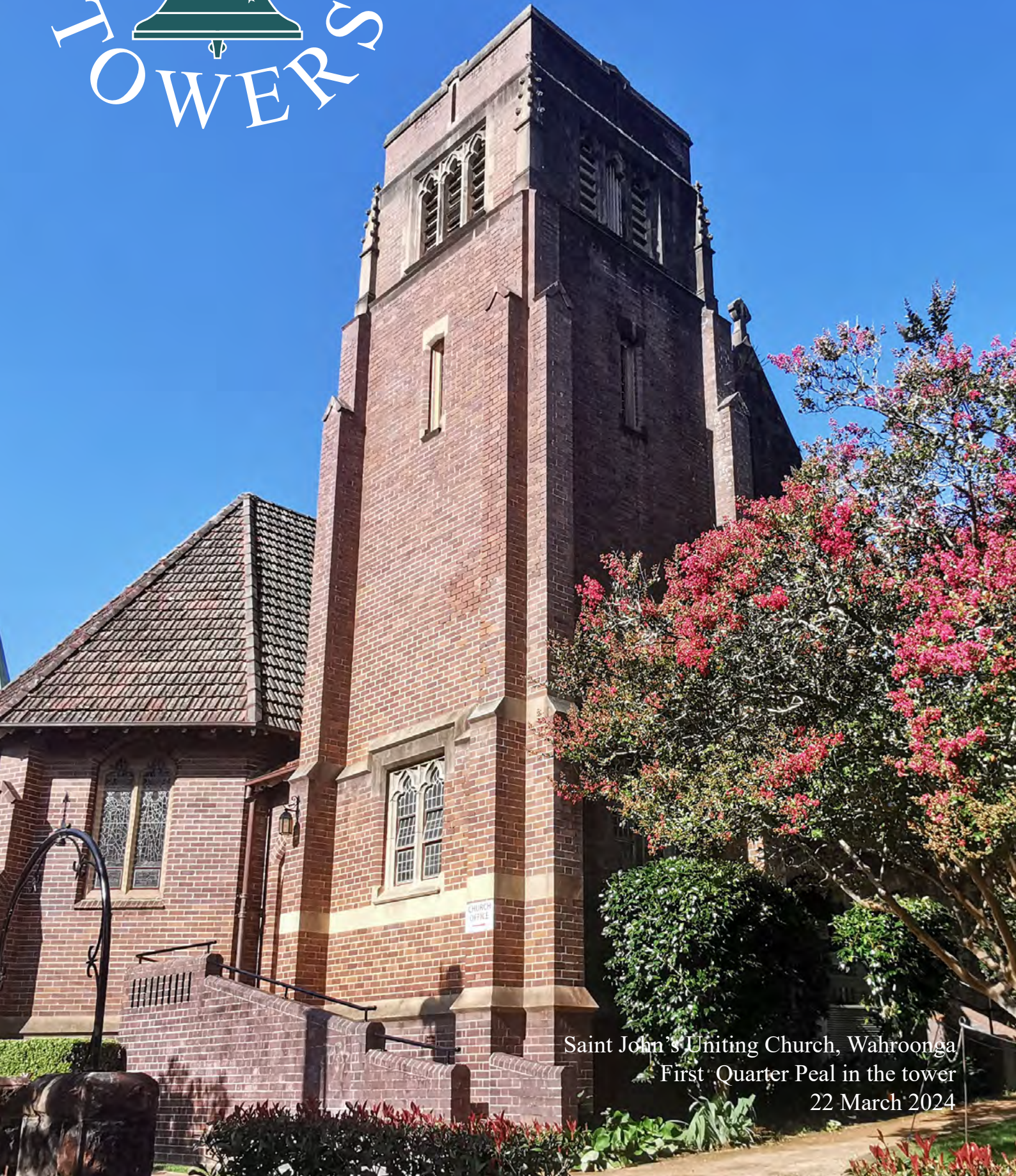
Saint John's Uniting Church, Wahroonga First Quarter Peal in the tower 22 March 2024