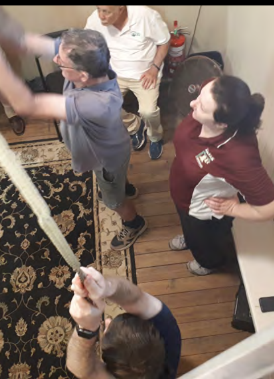
Bundaberg Intermediate Ringing Weekend, March 2024