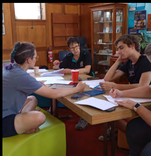
Workshop, Victoria Advanced Ringing Weekend, March 2024