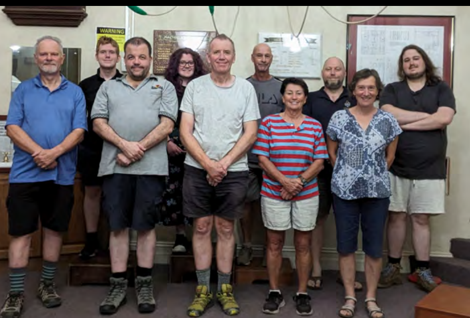
Cambridge Royal quarter peal band, Adelaide Advanced Ringing Weekend, March 2024