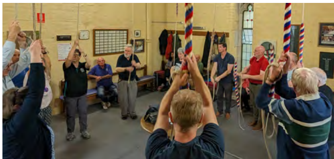
The Hobart 12-Bell Weekend in action at St David's Cathedral