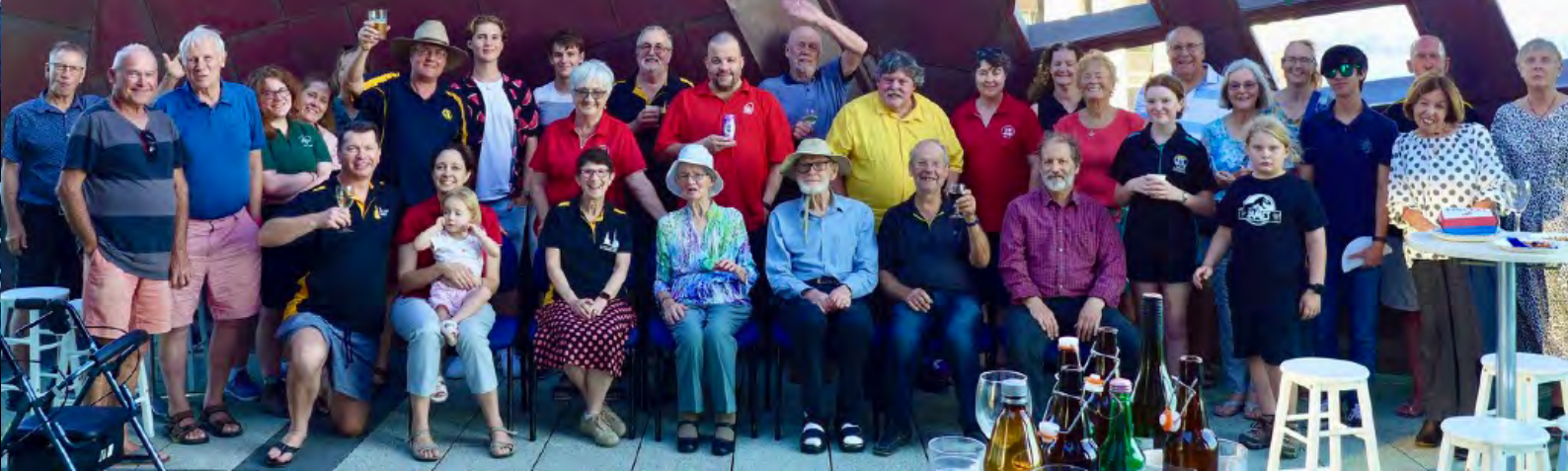
The Bell Tower annual pizza evening held during the Perth Advanced Ringing Weekend, January 2024