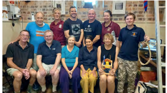
Bundaberg Intermediate Weekend attendees