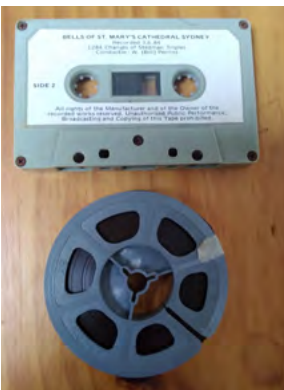
Great Adventure 2 and St Mary's old bells in outdated media

A second issue is that media come and go in popularity and use. While the changes have usually been for the better in the short term, where does that leave the material stored in older forms?