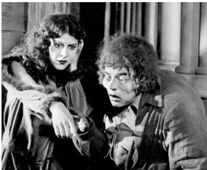
Esmerelda points out the finer points of striking to Quasimodo (1923)