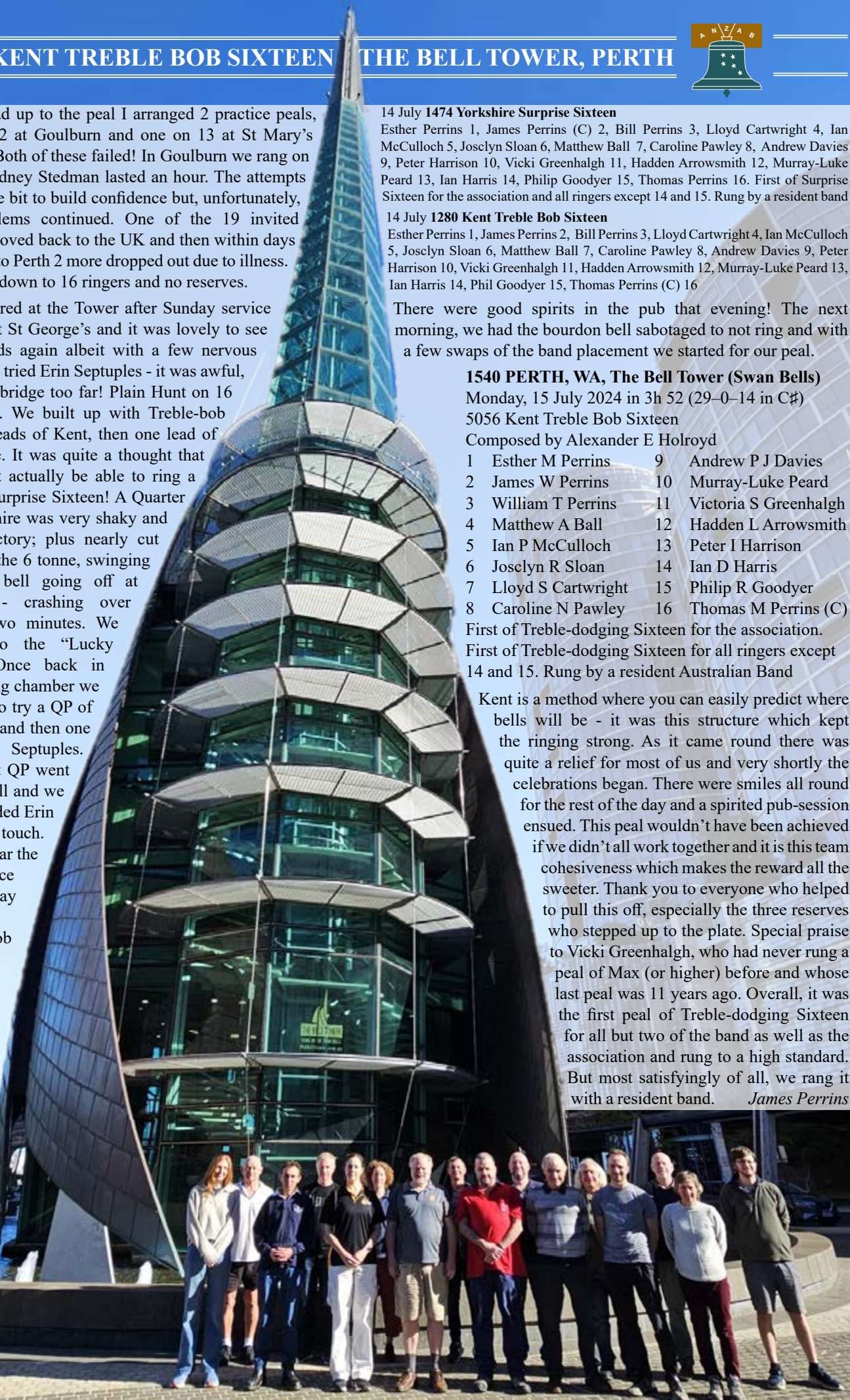
Above: The peal band, 1-16, clockwise from front right.