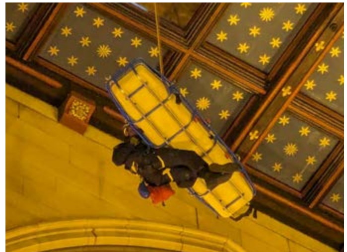
Above: lowering the "teacher/patient", accompanied by Police Rescue. Far Left: the long drop from the trapdoor to the Cathedral Nave floor.

The teacher / (now) patient was stable when the emergency services arrived but the obvious question was extraction. The 111 spiral stairs were very quickly ruled out, and as this wasn't our first rodeo we immediately showed the trap door under some carpet to the Police Rescue as well as the load tested hook for lowering. Furniture was moved, trap doors opened, along with safety fencing so no one would accidentally fall down. A couple more ringers went downstairs to move the pews for a clear landing. The Police Rescue and Ambulance team did their job and the patient was on terra firma within 90 minutes of the event.