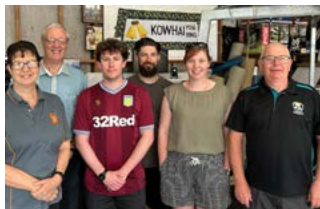
Above, The band, Left-Right, 4, 1, 2, 6, 3, 5